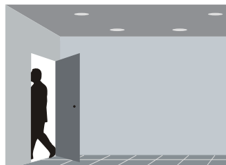
No presence detected, lights off