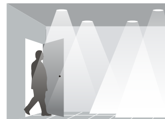
Presence detected, lights on