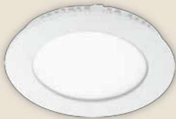
IrisLED Slim RO LD80