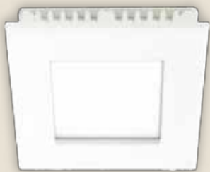
IrisLED Slim SQ LD81