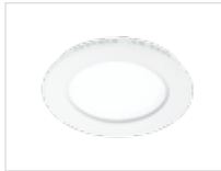
IrisLED Slim RO