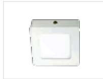
IrisLED Slim SQ SM